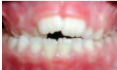
CROSSBITE OF BACK TEETH

Top teeth are to the inside of bottom teeth