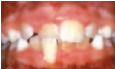
CROSSBITE OF FRONT TEETH

Malocclusions (“bad bites”) like those illustrated below, may benefit from early diagnosis and referral to an orthodontic specialist for a full evaluation.